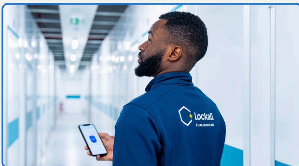
Seamless facility management with One Access app.

Sensorberg's smart solution is highly scalable, making it easy for Lockall to expand services and add more units without significant changes to the infrastructure. This flexibility has been crucial for Lockall's growth strategy.